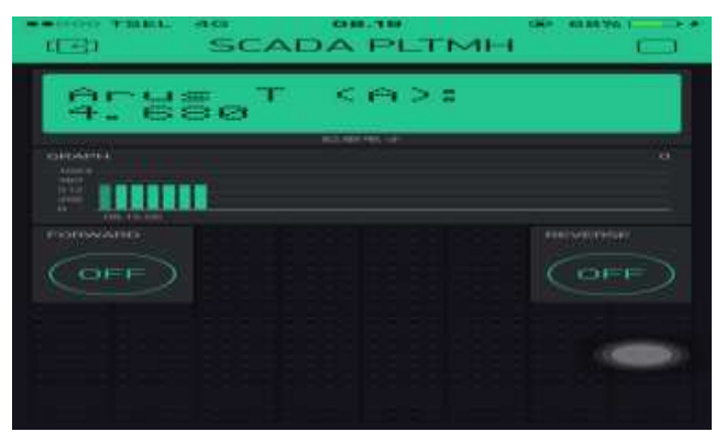
Figure 3. Monitoring Measurements on Phase T using ACS712 30A current sensor with smartphone.

Testing is a step used to determine the extent to which the suitability between the design with the reality on the tool that has been made. Testing tools are also useful to know the level working after testing.